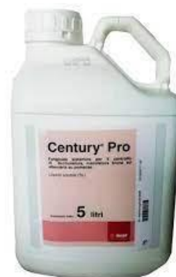
Figure 7. Century Pro®, BASF

EUH401 To avoid risks to human health and the environment, follow the instructions for use