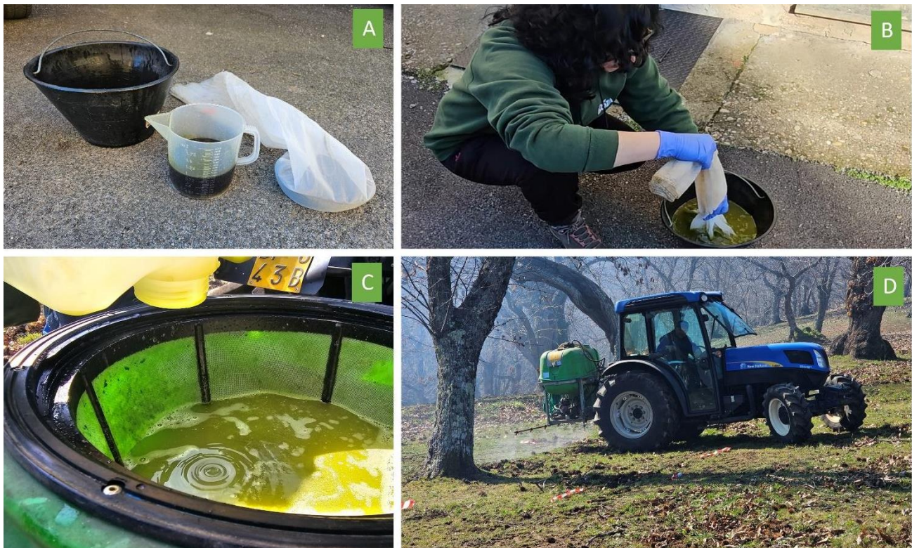
Figure 4. Preparation of Biofence FL. A) Prepare and measure the ingredients. B) Immerse the filter bag in the mixture of water and liquid solution. Leave the flour to infuse for at least one hour. During this time, shake the filter regularly so that all the flour is in contact with the liquid solution. C) After 1 h, rinse the filter bag and add the solution to a fumigation or fertilizer tank. D) To apply by treating the surface below the crown of the tree.