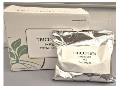
Figure 6. Tricoten, Atens®