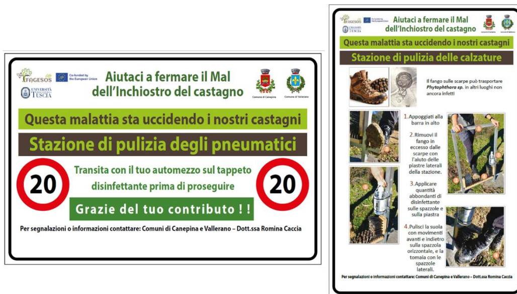
Figure 11. signposting for hygiene measures and citizens awareness installed in chestnut areas from Canepina and Vallerano municipalities.