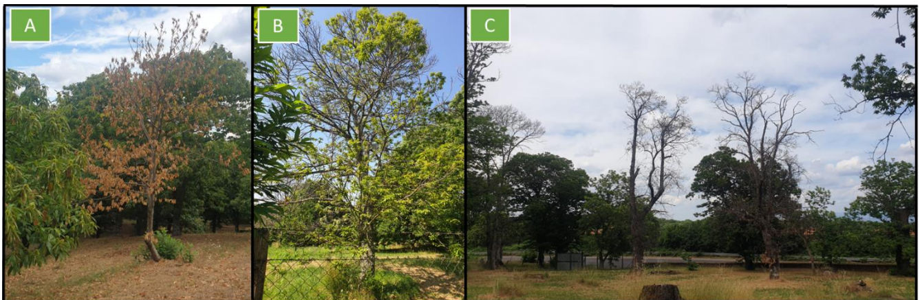
Figure 1. Suddenly dead plant with brown leaves still on the tree (A). Crown decline (B) Ink disease of chestnut: tree mortality and ecosystem degradation of a sweet chestnut ( Castanea sativa ) forest in Italy (C).

The appearance of these symptoms corresponds to an advanced phase of the disease when most of the root system is already compromised (Vannini and Morales-Rodriguez, 2019) (Figure 1).