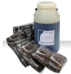
Figure 3. Biofence FL. 10 liters of formulation + 5 KG of flour.