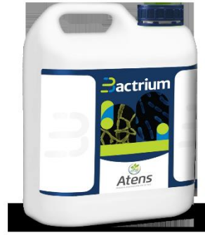
Figure 5. Bactrium, Atens®

Total rhizosphere bacteria: 1x10 10 UFC/g