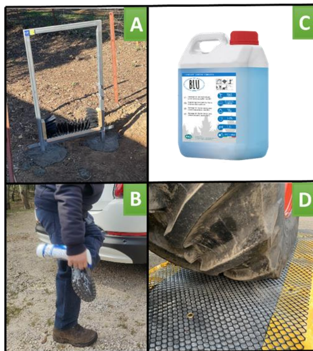
Figure 9. Footwear cleaning stations (A). Mobile cleaning kits (B). Disinfectant liquid (Blu, Arco chemical group)(C). Vehicles cleaning stations (D)

Vannini et al. (2010) suggested the following hygiene precautions and practices: (1) the restriction of the transit of people, animals and machinery in infected groves and along roads and trails crossing or bordering the groves, at least during flooding periods; (2) the disinfection of tires and shoes when at the exit from infected areas; (3) the management of superficial water flows by collecting and channeling infected water out of the chestnut area. Measures as listed in points (1) and (2) are cost-effective, but their successful application depends on education and awareness among the chestnut stakeholders and private citizens. The latter measure is costly and not easy to implement in large infection foci.