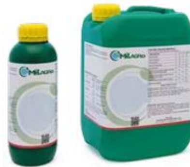
Figure 8. Kalex EVO®, Milagro International S.p.A.